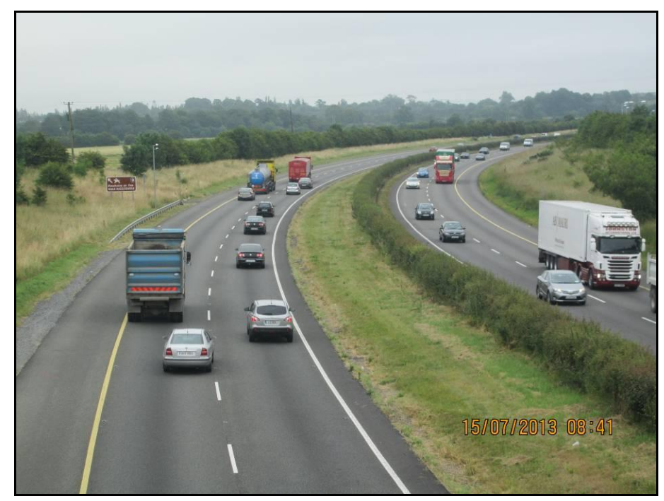
Plate 5.1: Existing two lane M7 with wide grass median.

Figures 4.1 to 4.10 in EIS Volume 3 indicate the alignment and road boundary of the proposed scheme.