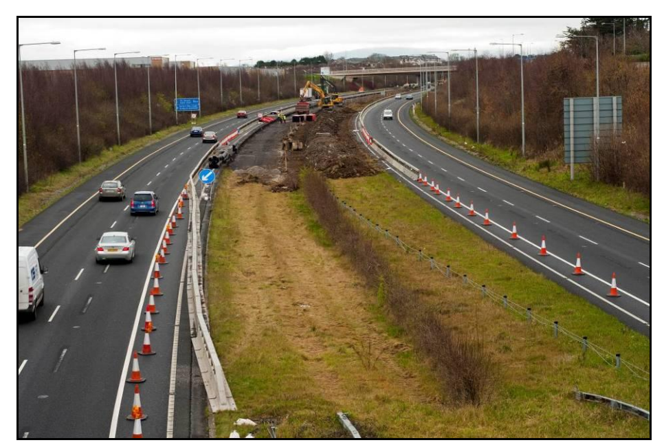
Plate 5.2: M1 Widening under construction

In accordance with National Roads Authority standards the new reduced width median will be provided with a continuous concrete safety barrier throughout the length of the scheme.