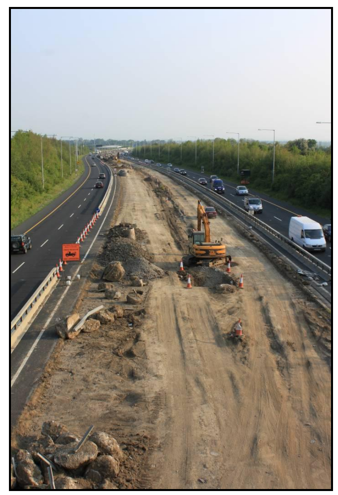
Plate 12.2: M1 Widening project under construction

As no additional lands beyond the existing road land take will be required for the widening it is concluded that there will be no impact on Material Assets as a consequence of the widening.