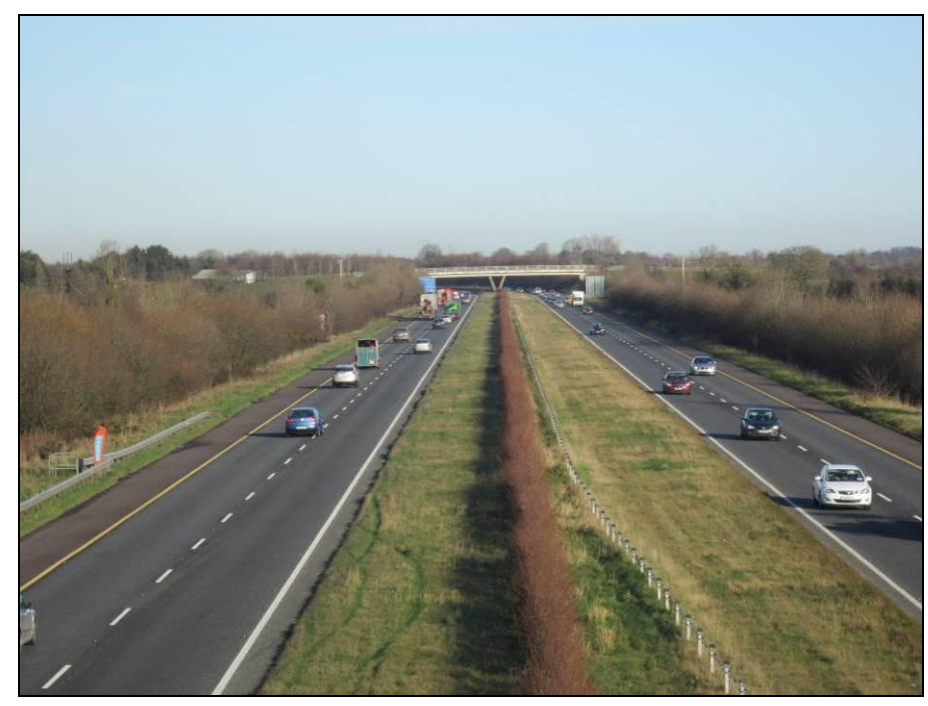
Plate 8.1: Habitats present in motorway median