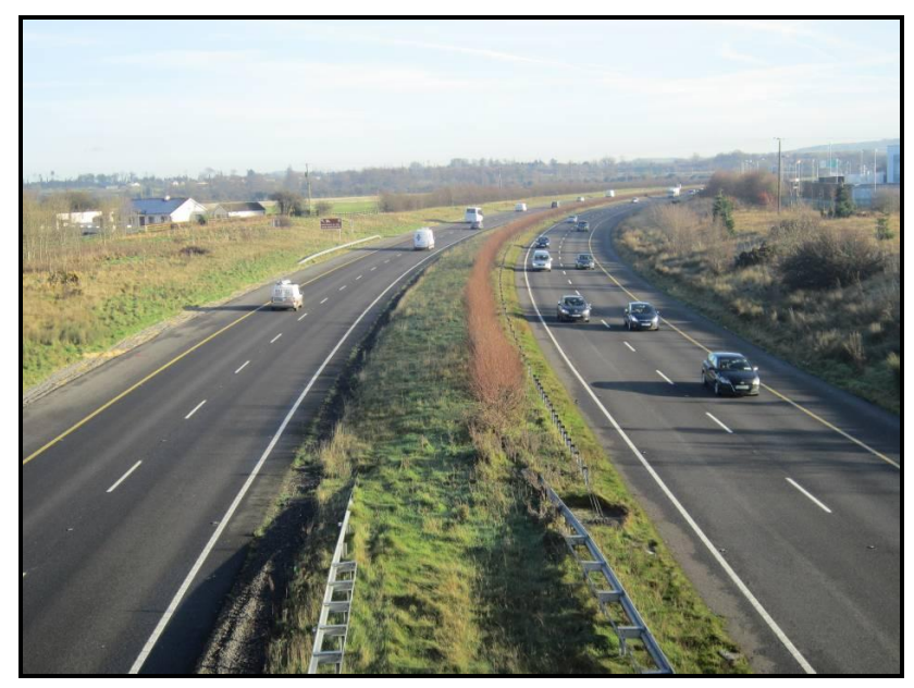
Plate 12.1: Typical stretch of the M7 highlighting width of central median

The proposed widening of the M7 involves the addition of a third lane to both the eastbound and westbound lanes of the M7 motorway between Johnstown and Great Connell. The additional lanes will be developed within the existing land take of the M7 motorway – refer Plate 12.1 , below, which outlines the available width of the central median and Plate 12.2 which presents the M1 Widening Project where the third lane was also widened within the existing median.